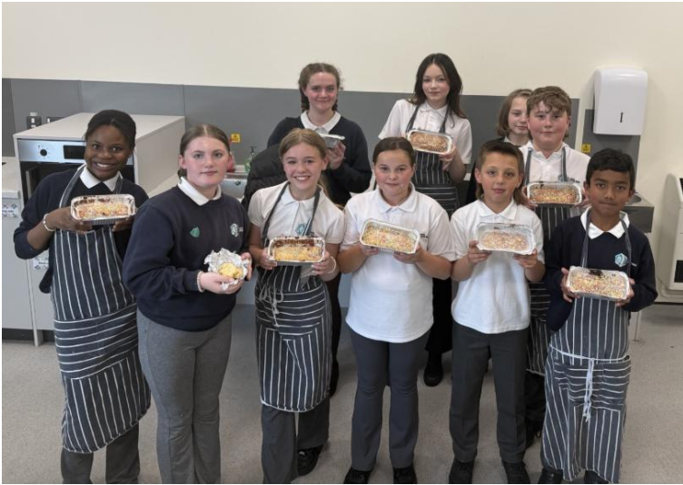
Year 7 taking part in after school cooking rewards 🧑‍🍳 🍰