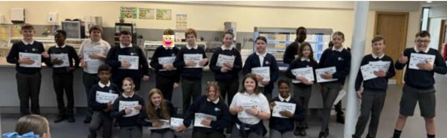
Year 7 pupils receiving their end of half term rewards.