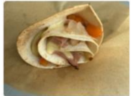
Year 4 making wrap flowers 🌹