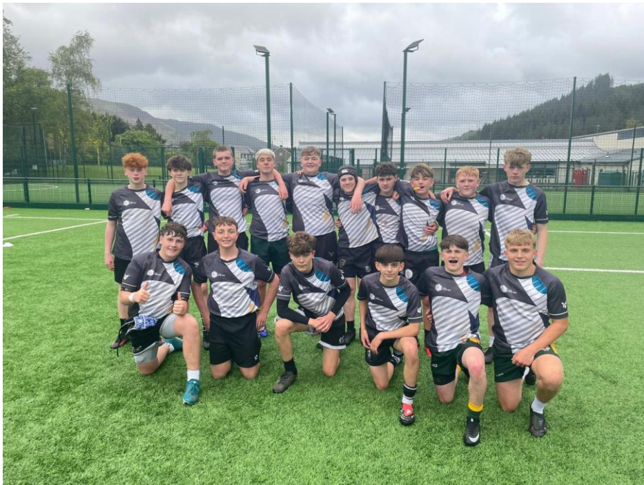
Year 9/10 boys' rugby, win against Porth! Ending the year with a 100% record!